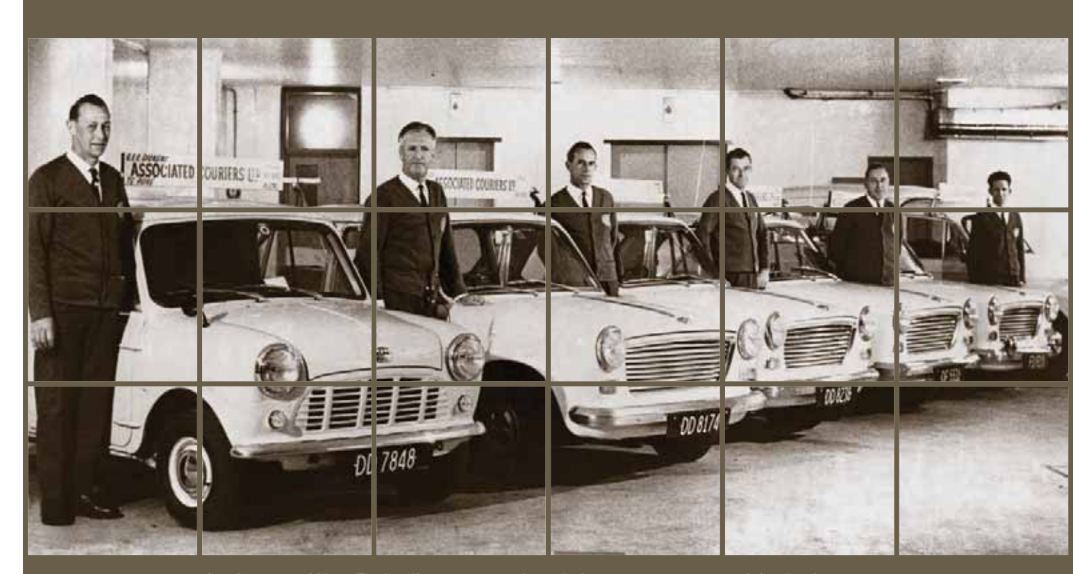
As pioneers of New Zealand's express package industry, we trace our origins back to 1964.